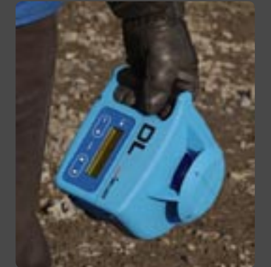
INTEGRATED RUBBER HANDLE

You can easily activate the TILT function to protect yourself against accidental movement of the laser setup. The DL will shut off and warn if hit or if one tripod leg sinks. TILT is activated on the user configuration menu (press the MODE button a few seconds). Here you can also switch between automatic levelling or manual, you can mirror the Y axis grade for easy grading of both cambers, and you can lock the keyboard for added protection.